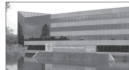
International Center of the Lutheran Church—Missouri Synod

While at the International Center, we will attend Chapel, have a tour of the center, visit the newly opened Historical Institute Museum , and lunch . Then we will tour Concordia Publishing House , including their spacious in-house book store, and historic Trinity Lutheran Church . This evening we are in for a treat with dinner at the Old Spaghetti Factory at the Landing by the Mississippi River. (CB, L, D)