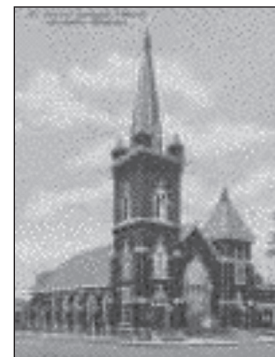
St. John Lutheran Church

This morning we travel to Amana, Iowa where we have lunch at the Ox Yoke Inn . The food here is legendary – delicious and plentiful – just as it was in the days of communal kitchens. Enjoy a family-style meal, along with a slice of pie. Yum! Wander the unique specialty stores featuring quilt shops, a meat shop, bakeries, a gourmet kitchen shop, just to name a few! We then proceed to Hannibal for our overnight. In the evening, we visit historic St John's Lutheran church for dinner and a presentation of the history of their church. (CB, L, D)